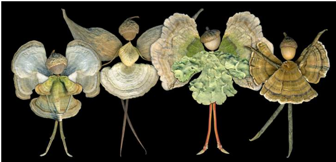
23. Acorn Loving Woodland Fairies: $62 12x6 Frame: natural cedar