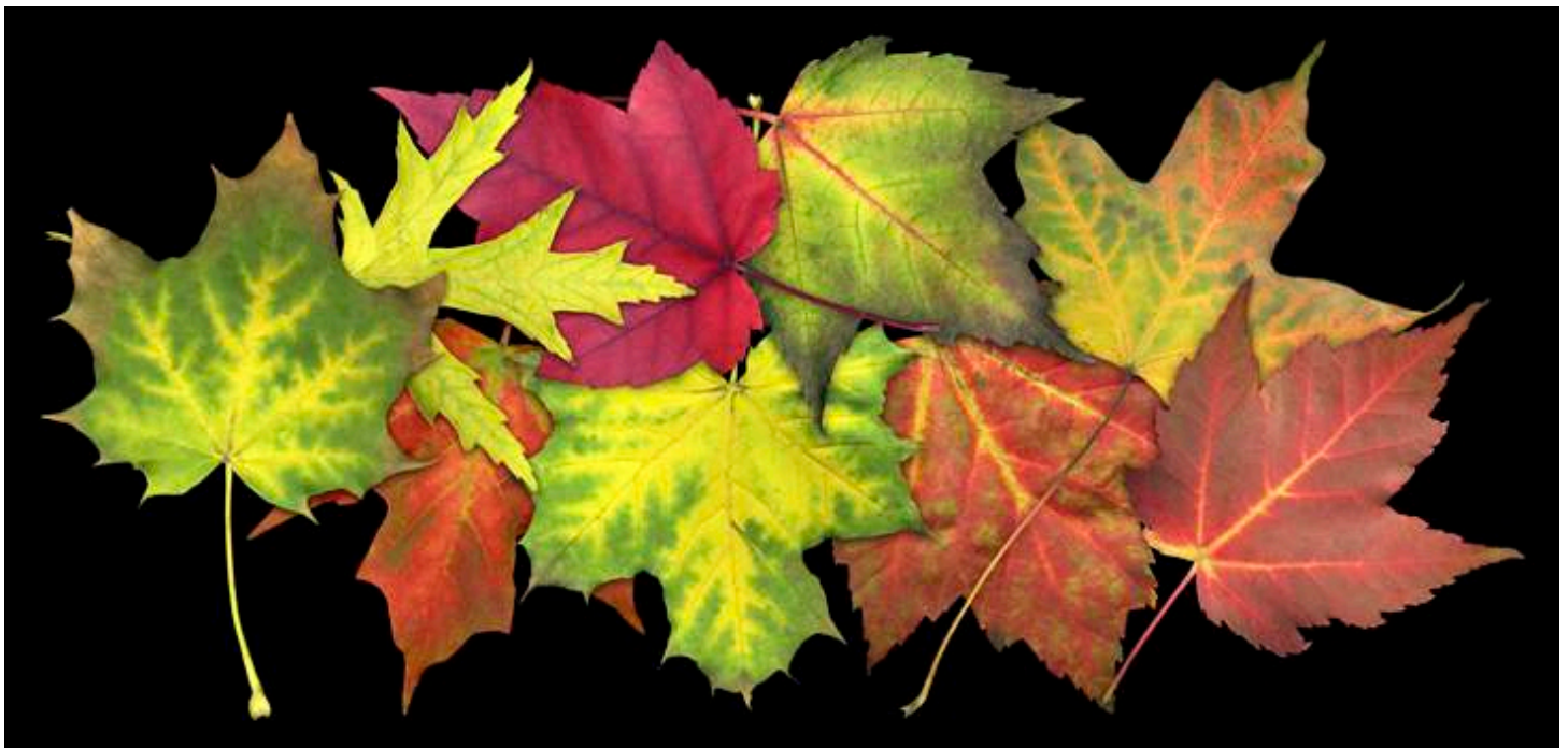
27. Autumn Maples: $62 12x6 Frame: select poplar