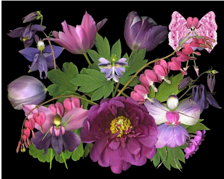
15. Tree Peony Bouquet with Fairies: $58 8x10 Frame: weathered gray faux wood