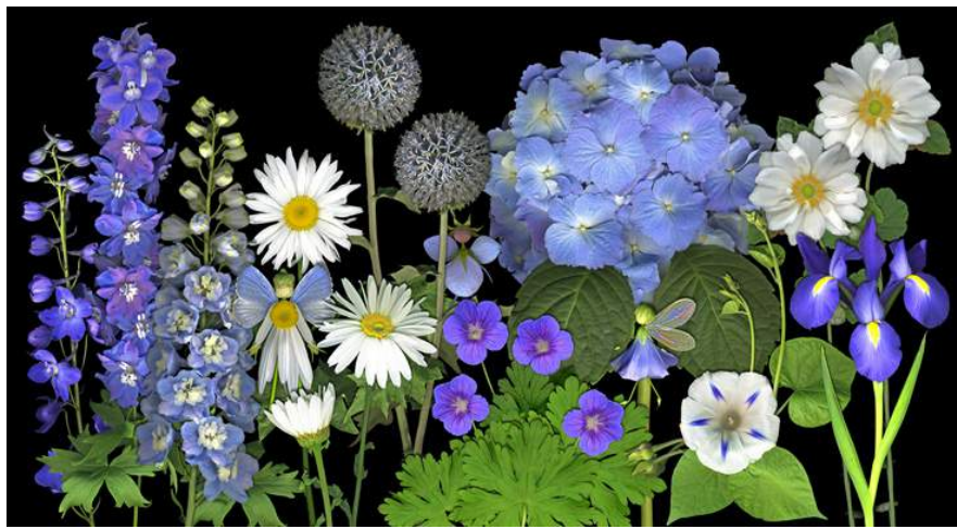
19. Blue and White Summer Garden with Fairies: $130