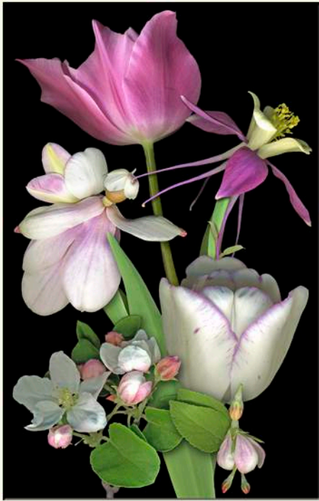
11. Tulip Fairy Garden: $40