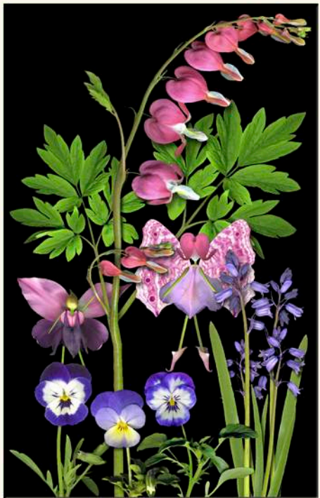
14. Bleeding Heart Fairy Garden: $40

Framing: ivory matted, dark faux wood frame