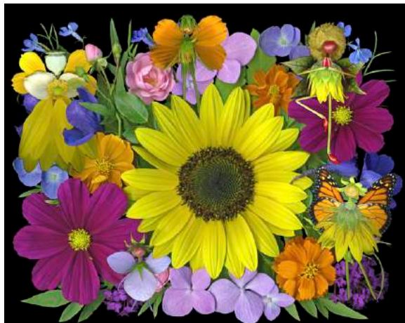
2. Summer's Bounty with Fairies: $58 8x10

Framing: ivory matted, dark faux wood frame