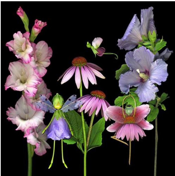
17. August Fairy Garden: $58 8x8 Frame: gray washed oak