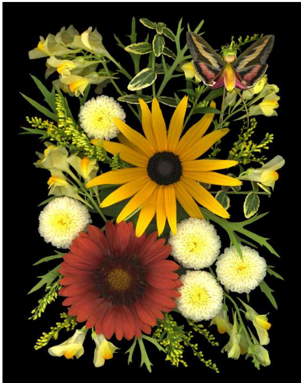
6. A Fairy in a Black-Eyed-Susan Bouquet: $85 11x14 Frame: handcrafted etched solid pine with dark stain