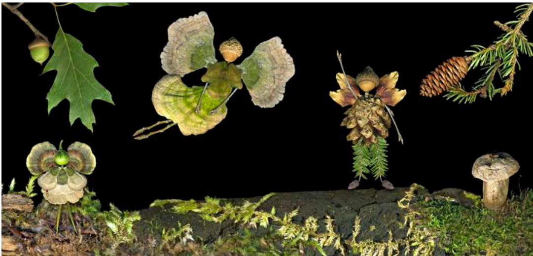
24. On a Woodland Floor: $65 12x6 Frame: handcrafted, painted pine