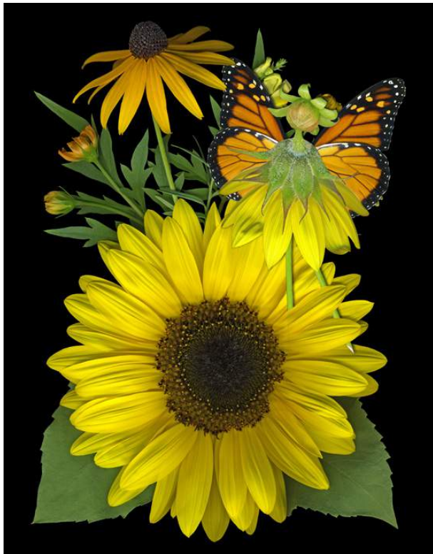
4. Sophie Sue in a Sunflower Bouquet: $85 11x14 Frame: handcrafted etched solid pine with dark stain