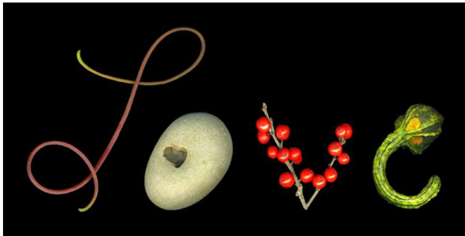
25. Nature's LOVE: $65 12x6 Frame: handcrafted butternut