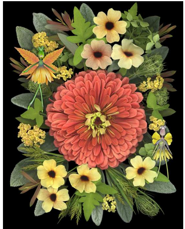
5. Hide and Seek in a Zinnia Bouquet: $85 11x14 Frame: handcrafted etched solid pine with dark stain