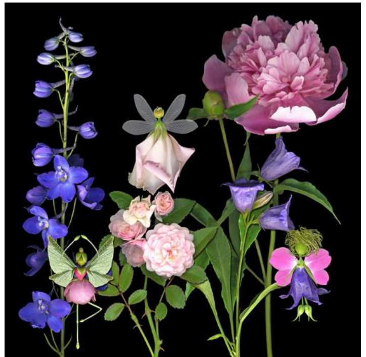
18. June Fairy Garden: $58 8x8 Frame: gray washed oak