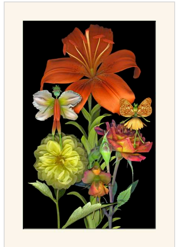
7. Orange Lily Fairy Garden: $40 5x7 Frame: ivory matted, dark faux wood frame