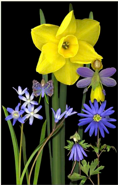
13. Early Spring Fairy Garden: $40

Framing: ivory matted, dark faux wood frame