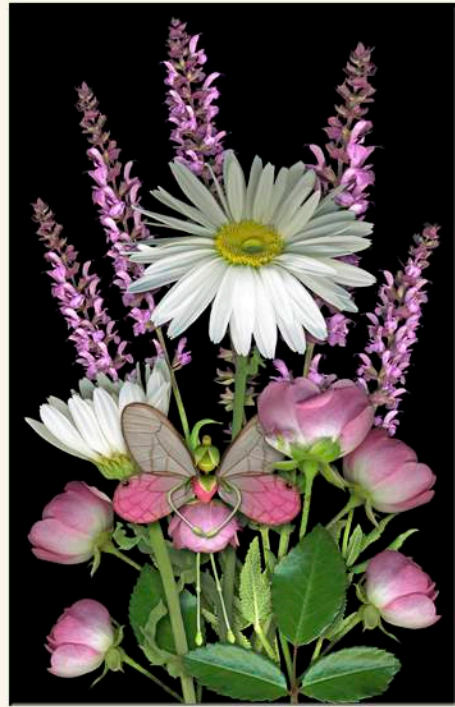
12. Pink and White Summer Fairy Garden: $40

Framing: ivory matted, dark faux wood frame