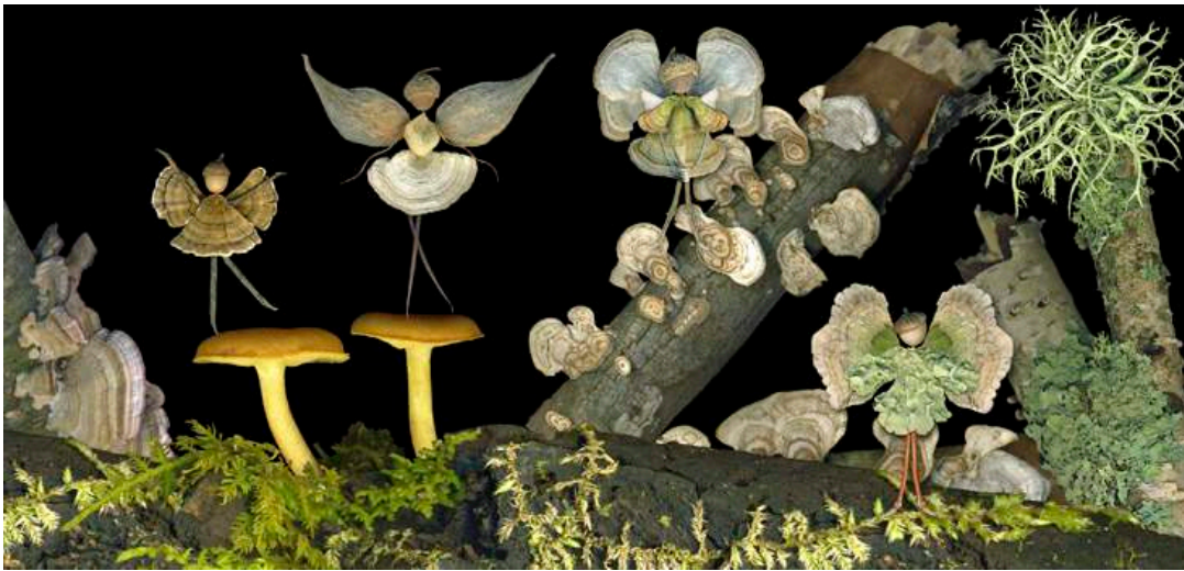
22. Woodland Congregation: $65 12x6 Frame: handcrafted, painted pine