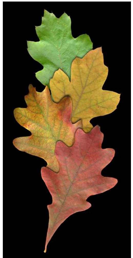
26. Oak Leaves in Oak: $65 12x6 Frame: handcrafted solid oak