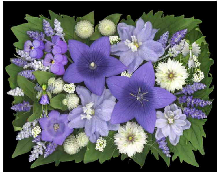
16. Balloon Flower Bouquet with Fairies: $58 8x10 Frame: weathered gray faux wood frame