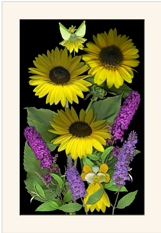
1. Sunflower Fairy Garden: $40 5x7

All pieces are created from natural elements using photo scanning. Frame descriptions are included. Please check the sizes. Images are not presented to scale.